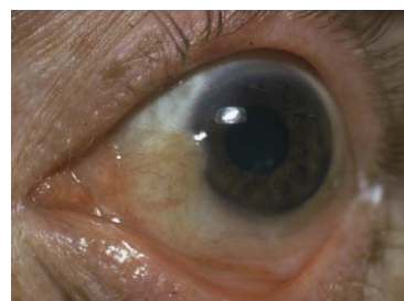
Fig. 2 An early pterygium.